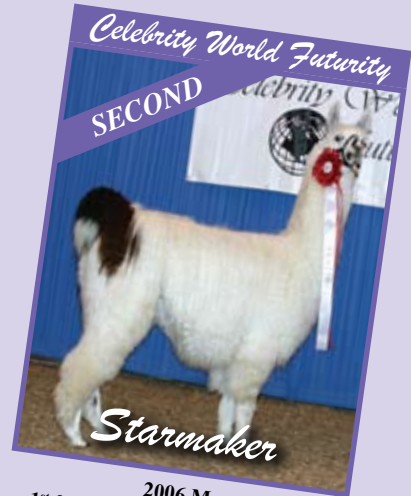
Starmaker 2006 M 1 st 2008 Western States Futurity Qualified for Nationals