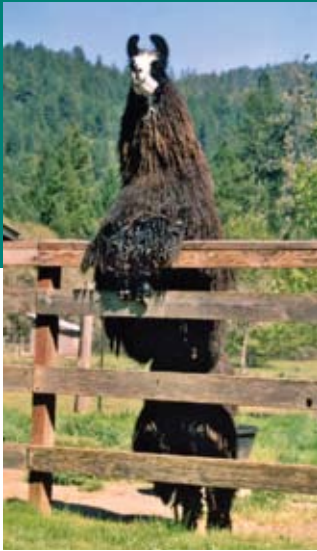
Starr Fyter- Producer of Champion and high selling offspring. Co-owned with East Fork Ranch