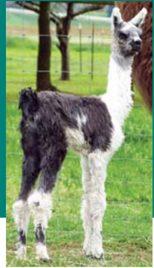
Right — Newest Inca Legend female cria

our llamas and alpacas. I am very much hands-on with our animals, so the shots, nails, shearing, birthing and any needed medication is done by me. It's a labor of love and, as a result, it allows me to have a closer connection with the herd, allowing me to make breeding, buying and selling decisions based on my day to day interaction with my animals. With 5 large barns and with many pastures it allows us to not only to do pasture rotation, but also barn rotation. This is a great benefit in keeping a strong healthy herd. We will run both llamas and alpacas together depending on the needs of the individuals, but mainly do this at birthing time.