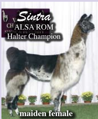
Sintra CH ALSA ROM Halter Champion