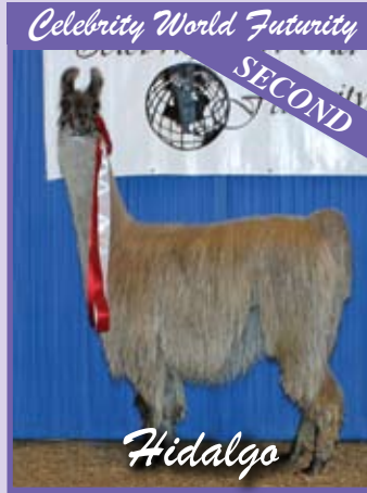
Hidalgo 2006 M 1 st 2007 Western States Futurity Qualified for Nationals