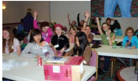
Youth conference attendees earning Llama Bucks.