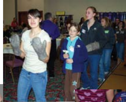
Left: Youth style show. Below: Seamless wet felting mittens.

So you may ask, "What do people do in below zero weather?" Well the folks in Minnesota put on a great inside party and enjoy the weekend talking about llamas!