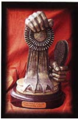
Craig Wilkins Memorial Sportsmanship Award