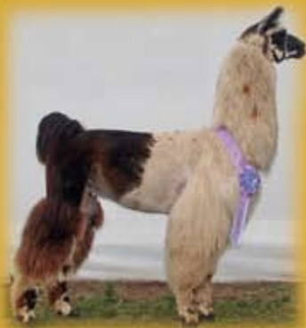
DARE TO DREAM (3/4 Argentine)