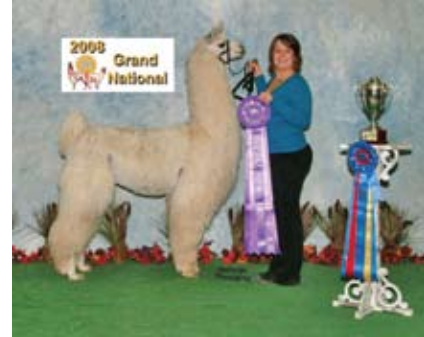
Argentine Poltergeist (ET) 2008 Grand National Reserve Champion Heavy Wool Male

“Did you see that llama? Oh my, what a beautiful animal! I have not ever seen such an exotic llama!” Yes, there is excitement in the air! We just got back from the Celebration Sale in Oklahoma City and what a great experience we had. We were fortunate to have some magnificent Argentine llamas represented there in the shows. We had taken two full Argentines to show in the World Futurity and had nothing but wonderful comments on both. There were also several more awesome full Argentines there, plus some really great part Argentines. And there was excitement in the voices of those talking to us about them.