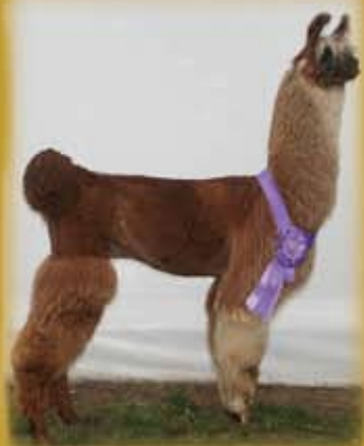
ARGENTINE NEVADA SMITH (Full Argentine) 2009 WORLD FUTURITY TOP TEN