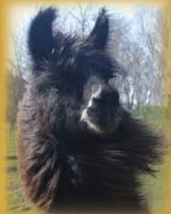
KOBRA'S THUNDERBOLT (1/2 Argentine)