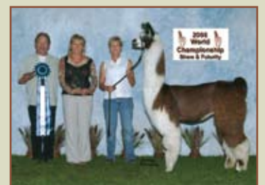
Class #1 Males GNLC Full Tilt Wilkins Livestock/Westerham Farm