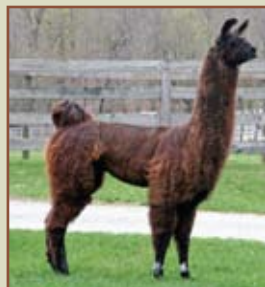
Class #4 Females MHF Sirius Style Margaret Fowler