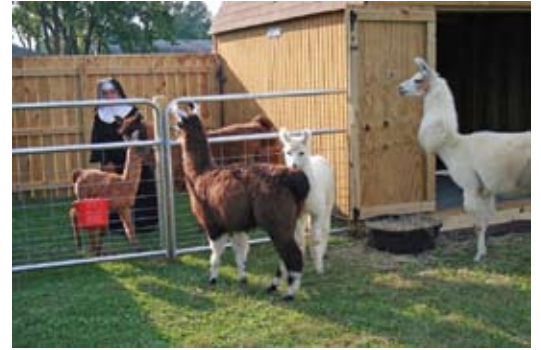
Checking out the new baby

Being a Monastic community, we obviously resorted to our Monastic roots and asked for Divine Providence to intervene. I was actually searching the Internet for sheep when, as you know, one web-site leads you to another. I ended up opening a web-site and “SPLASH” ... right before my eyes was a little white Miniature Llama that was for sale. I could not look any further. This little girl just captured my heart. The problem was – she