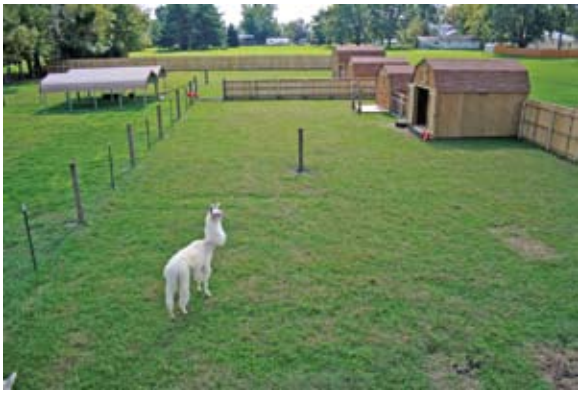
The paddocks of Monastic Fleece