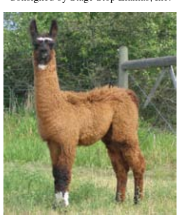
Red Don Consigned by M and M Llamas