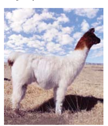
TJLF Juno Consigned by TJ Llama Farm