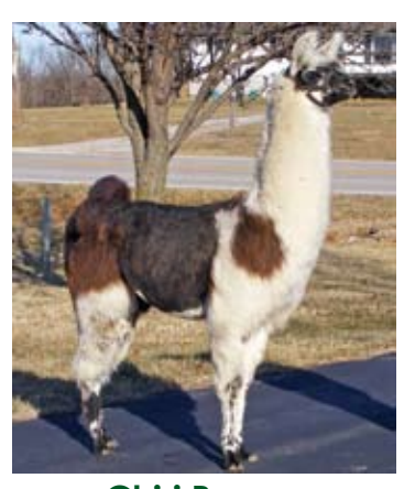
Chiri Peppa Consigned by CriVen Llamas