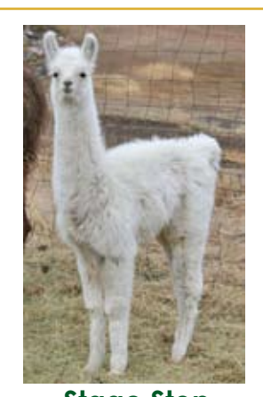
Stage Stop Candle In The Wind Consigned by Stage Stop Llamas, Inc.