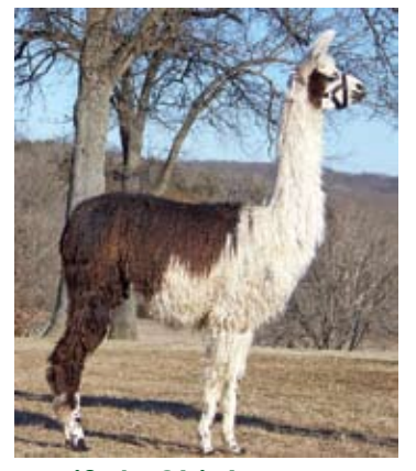
Pacific's Chick-A-Boom Consigned by Pacific Llamas